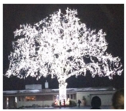
The Lighted Oak of Bloomington